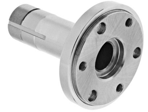
D - Chuck diameter