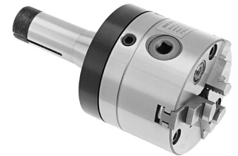
W - Chuck diameter